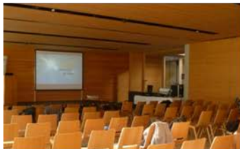
Conference & Sessions

The best place for a sustainable Food Startup conference in DACHLI.