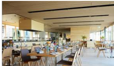
Food & Exhibition I