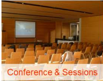
Conference & Sessions

The best place for a sustainable Food Startup conference in DACHLI.