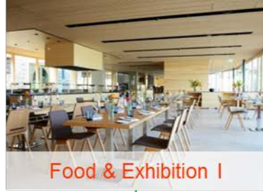
Food & Exhibition I